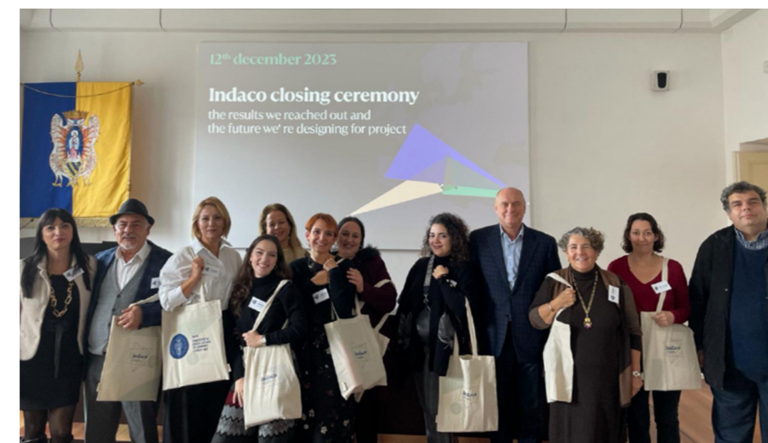
04. The final meeting of the project, with some of partners involved.